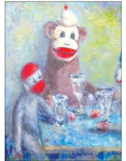
Monkeys with Intellectual Pursuits by Thomas Andfield is included in the exhibit.